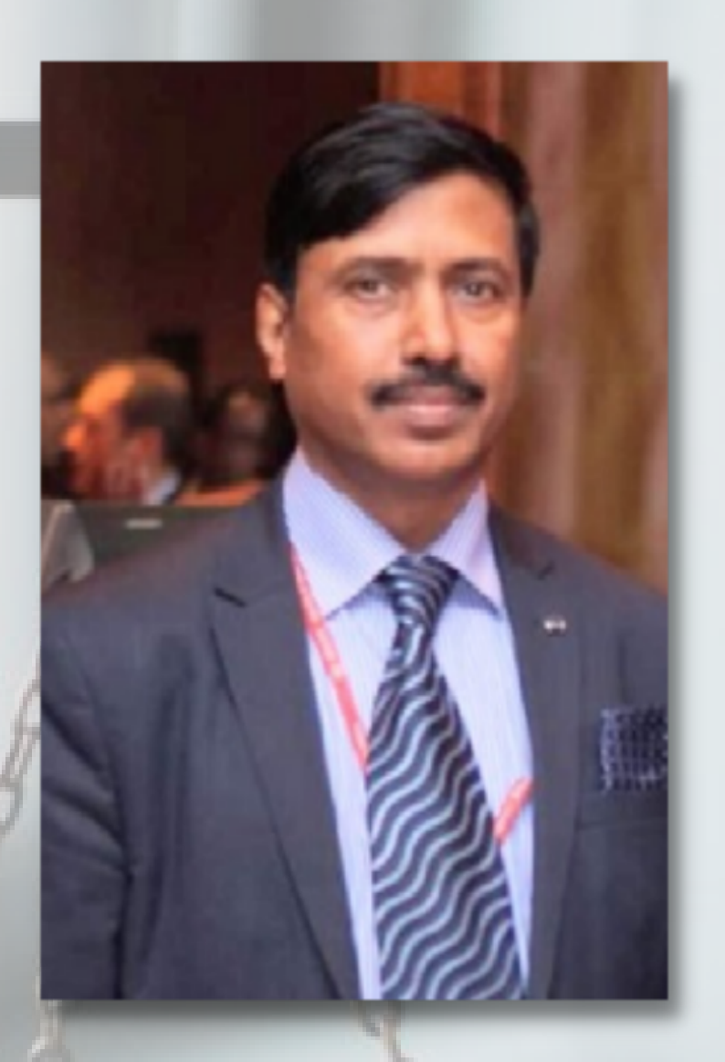
G.R.Raghvendra Joint Secretary Department of justice, Ministry of Law and justice, Government of India