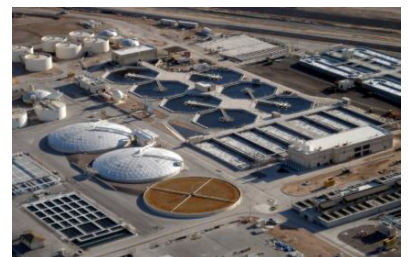
Aerial view of a typical wastewater treatment plant