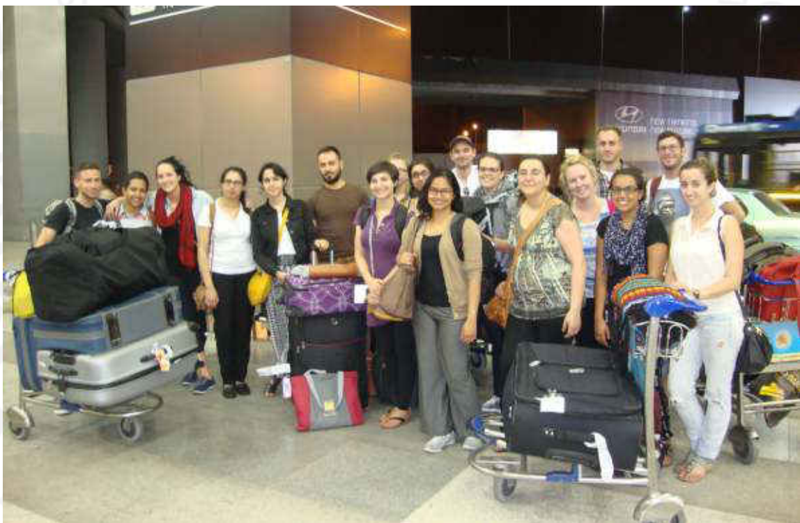
BYID Interns at Indira Gandhi International Airport after their arrival In India