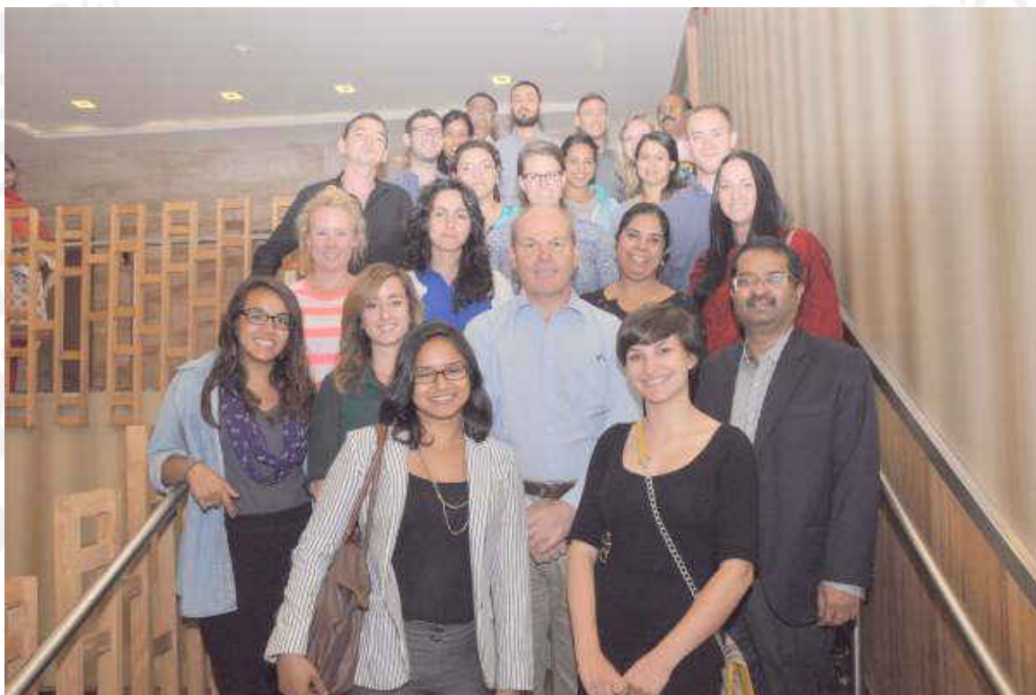
Group picture from BYID orientation held at Hotel “The Metropolitan” on June 20, 2013.

SICI India Office conducted a half-day orientation programme on July 20, 2013 for the interns before they left for their respective host institutions. To evaluate the project a mid-term review and final review was conducted by members of the Executive Council and staff from the India and Canada offices. The report for the programme was submitted to CIDA/DAFTD Canada.