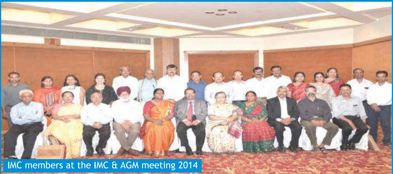
IMC members at the IMC & AGM meeting 2014