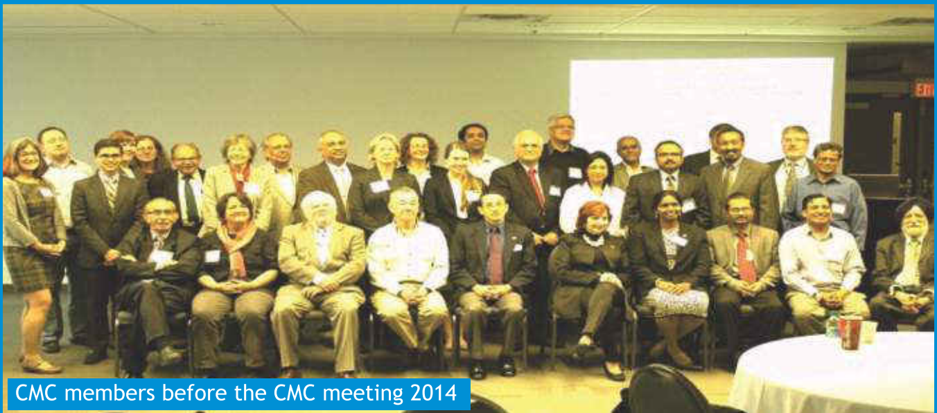
CMC members before the CMC meeting 2014

Shastri Office thanks and appreciates all its members, donors and funders for providing continuous support to execute its mandate and managing various activities and affairs. Shastri office has evolved over the years with tremendous support from stakeholders. We acknowledge with thanks, the support our Executive council has provided to shastri Institute in various capacities.